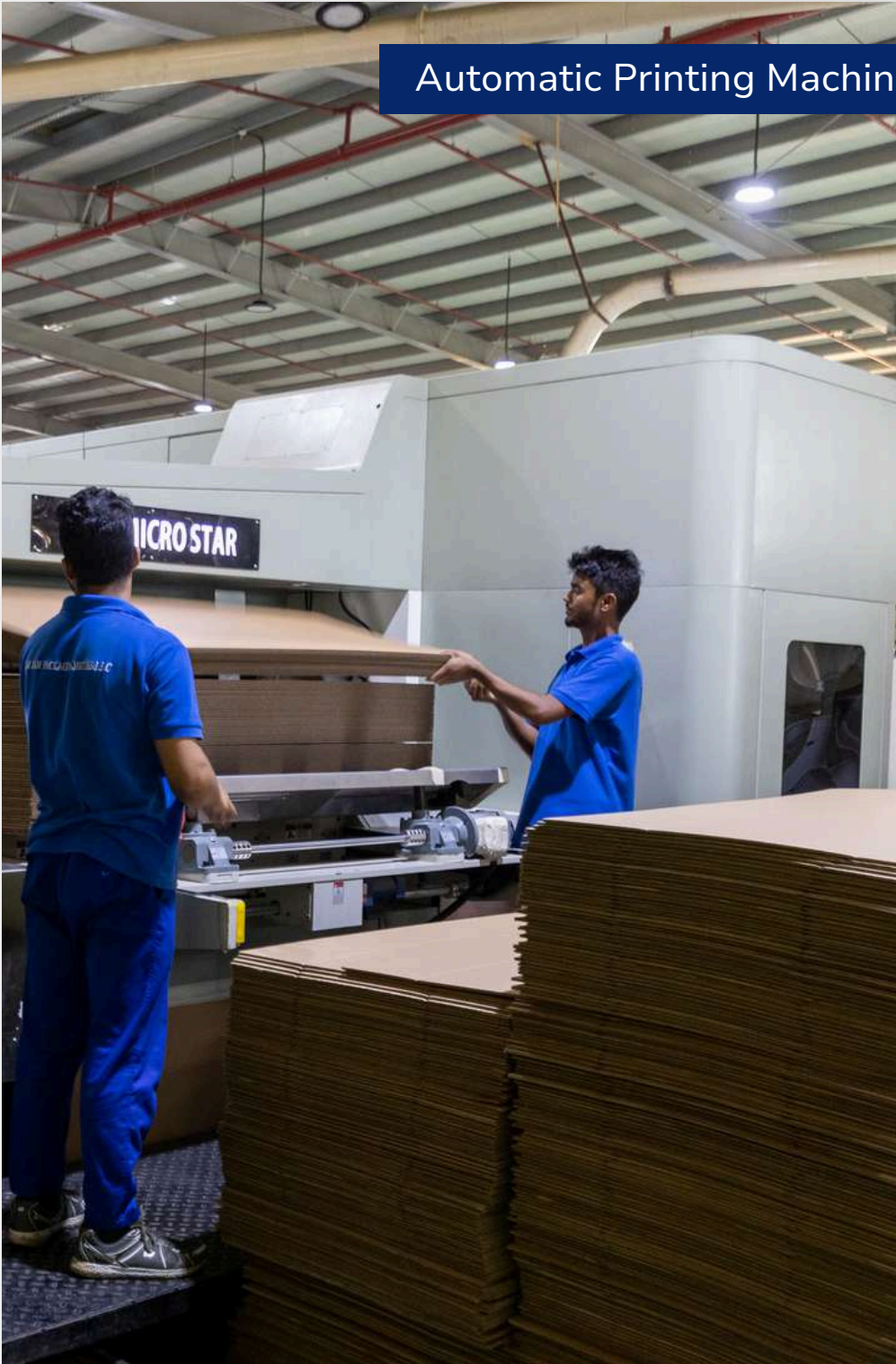
Automatic Printing Machine